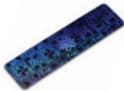
size: L 4" x W 1"