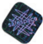
actual size 5/8"